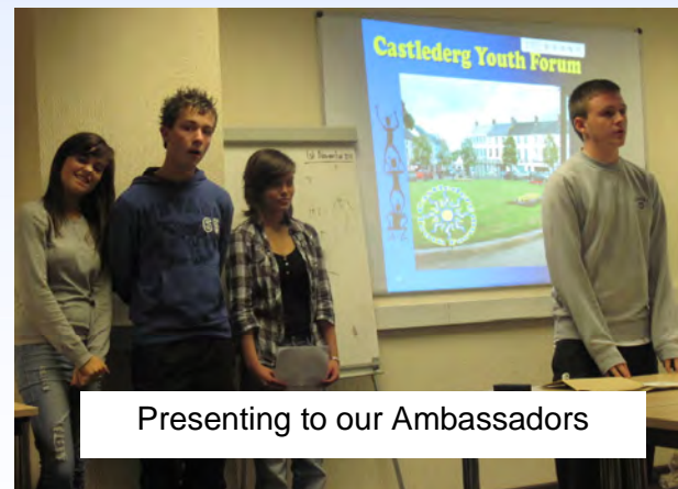
Presenting to our Ambassadors